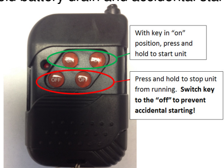
AMERICAN FAB INC TRAVELERS REST, SC

Battery Drain When the unit is not operating always keep the ignition key in the "OFF" position to avoid battery drain and accidental starting!